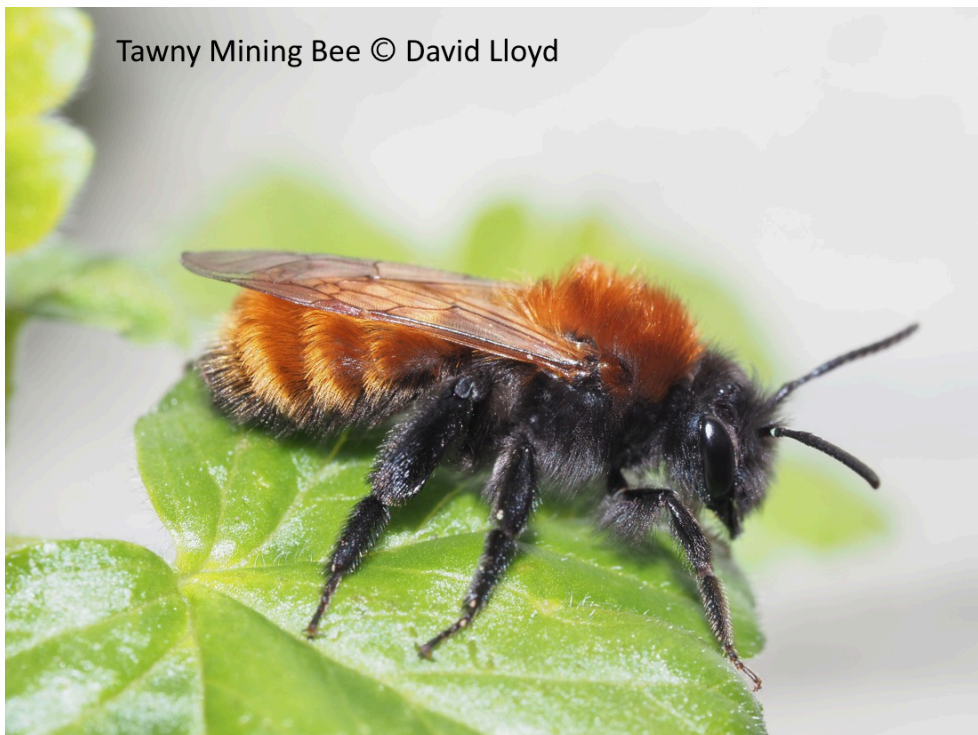
Tawny Mining Bee

SUBSCRIBE TO THE FREE MONTHLY NEWSLETTER: Green Team, Biodiversity Champions, colleagues