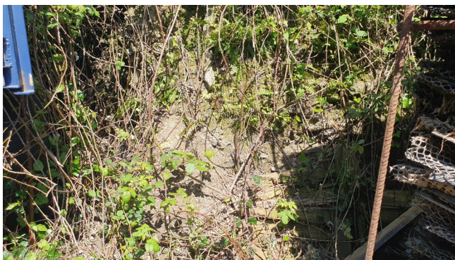
South facing earth bank for solitary mining bees.

An initiative by BORD BIA IRISH FOOD BOARD