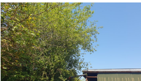
Willow adjacent to building