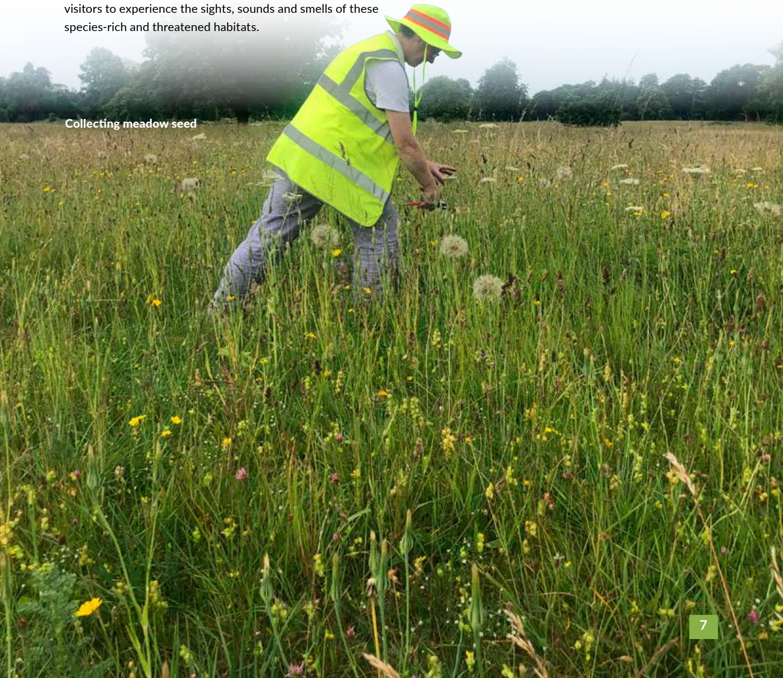
Collecting meadow seed