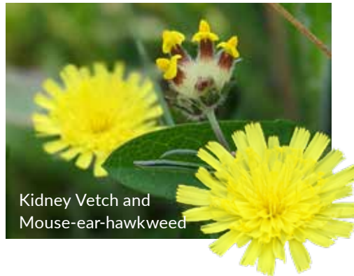
Kidney Vetch and Mouse-ear-hawkweed

Large areas of species-rich calcareous grassland are found in this area. Many orchid species have been recorded including - Common Spotted-orchid, Frog Orchid, Heath Fragrant-orchid, Heath Spotted-orchid and Lesser Butterfly-orchid. A succession of flowers bloom from early spring until autumn, including Primroses, Mouse-ear-hawkweed, Lady's Bedstraw, Wild Thyme, Common Bird's-foot-trefoil and Common Knapweed. Rarer species like Mountain Everlasting, Kidney Vetch, Carline Thistle, Rough Hawkbit, Burnet-saxifrage and Fairy Flax are also found. It is thus not surprising that it is a haven for wildlife, with insects, birds and mammals found throughout.