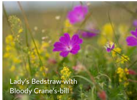
Lady's Bedstraw with Bloody Crane's-bill

Slieve Carran is also known by two other names - Keelhilla and Eagle's Rock. It's easy to see why it has the latter name, due to its dramatic limestone cliffs. Today Peregrine Falcons nest here, as do Ravens. At the base of the cliffs there are large areas of scrub and woodland, and the ruins of an old church and holy well. There is a magical air about the place, and a number of legends are known to locals. Come in spring to experience a veritable sea of Wild Garlic.