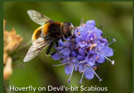
Hoverfly on Devil's-bit Scabious