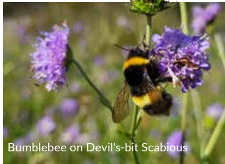
Bumblebee on Devil's-bit Scabious

'Big Meadow' is an island of grassland in the middle of the almost entirely wooded Glengarriff Nature Reserve (301 ha). It adds to the diversity, and is home to many invertebrates. The area has not been ploughed, reseeded or fertilised in living memory, but has been lightly grazed in autumn by cattle for many years.