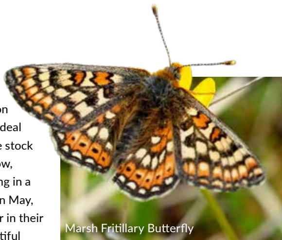
Marsh Fritillary Butterfly

Winter grazing with cattle on fixed dunes and machair is ideal for floral diversity. After the stock are removed, plants can grow, flower and set seed, resulting in a succession of wildflowers. In May, Early-purple Orchids appear in their 1,000's, followed by a beautiful variety of Early Marsh-orchid in June. In mid-summer, rarer species appear like Dense-flowered Orchid, Bee Orchid and the well-camouflaged Frog Orchid. Showier are the Marsh Helleborine and Fragrant-orchids. And it's not only orchids - Grass-of-Parnassus, Devil's-bit Scabious and Field Gentian flower in August, signalling the end of summer.