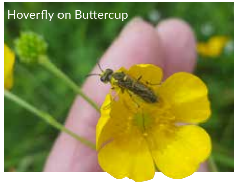
Hoverfly on Buttercup

In parts of Tallaght and Greenhills there are unimproved esker soils, and these offer great potential for species-rich grasslands. This potential was realised when the grass cutting management practices in Tymon Park were altered by South Dublin County Council to facilitate flowering species and pollinating insects. Most of these meadows are now cut only once a year, and clippings are removed to continue to decrease fertility and to encourage further wildflower species.