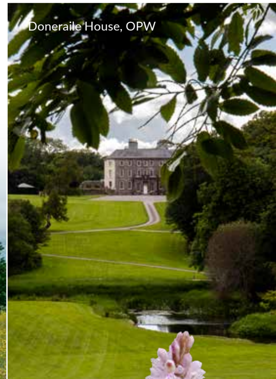
Doneraile House, OPW