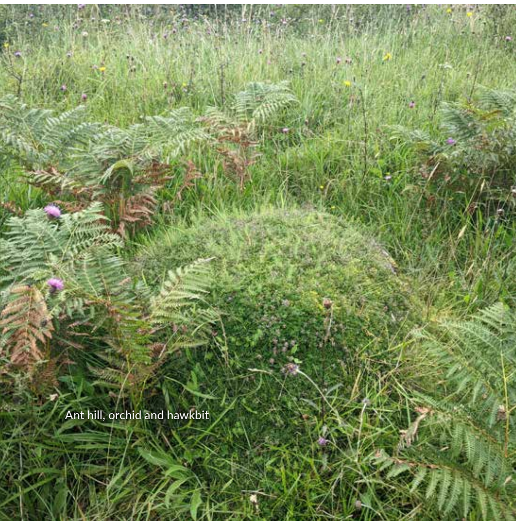
Ant hill, orchid and hawkbit