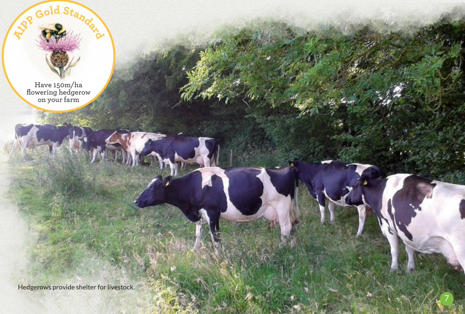
Hedgerows provide shelter for livestock.