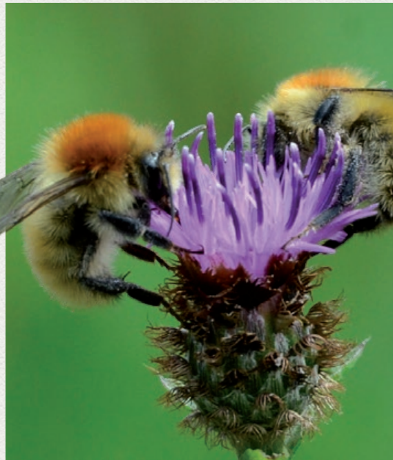
Large carder bee on Knapweed.

Fertilised and reseeded vs. natural regeneration on a farm in Co. Galway.