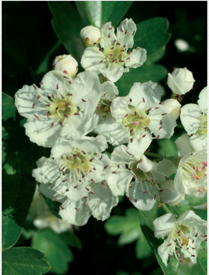
Whitethorn/Hawthorn is also called the May bush. It is easy to see from a distance which hedgerows are pollinator friendly as they will be white in May.