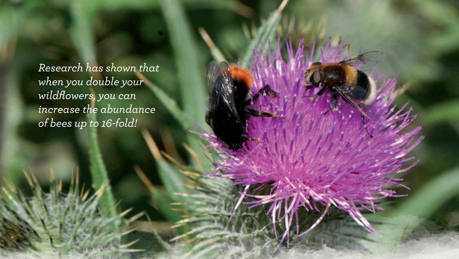
Bumblebee and hoverfly on thistle. This hoverfly (right) is a bumblebee mimic

Research has shown that when you double your wildflowers, you can increase the abundance of bees up to 16-fold!