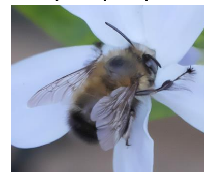
Hairy-footed Flower Bee Anthophora plumipes

When: March-May ID: Males have a long fringe of hairs on lower middle leg. First recorded in Dublin City, 2022