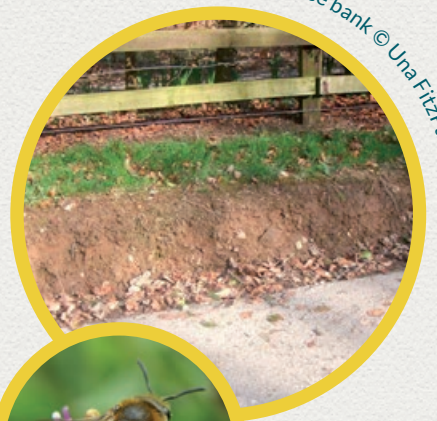
Solitary bee bank

Most solitary bees in Ireland are mining bees who nest in south or east facing slopes of bare earth (soil, sand, clay, peat)