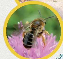
Solitary bee