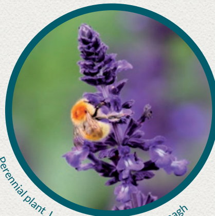
Perennial plant_Lavendar