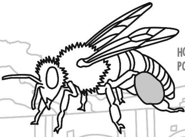
HONEY BEE CARRYING POLLEN ON ITS HIND LEGS