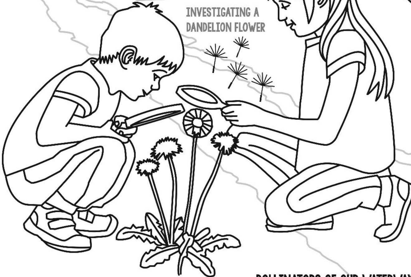
INVESTIGATING A DANDELION FLOWER